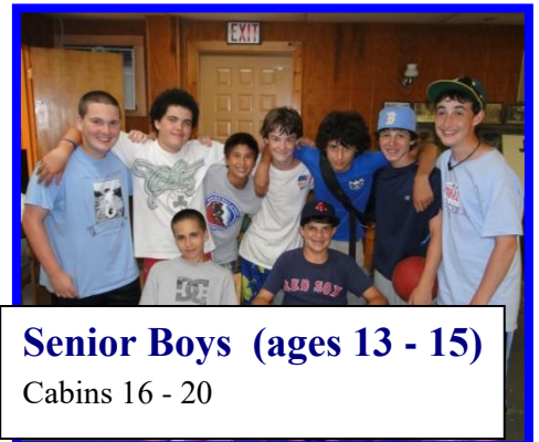
Senior Boys (ages 13 - 15)