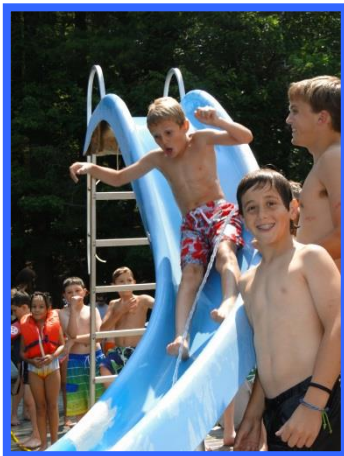
Fun at the waterfront

The camp offers a beautiful facility...a large historic dining lodge, 22 camper sleeping cabins, a recreational building, a state of the art ropes/challenge course, a large athletic field, a lacrosse field, a BMX Bike racing track, an archery range, a rifle range, tennis courts, basketball court, a volleyball court, nature trails, a gaga-ball pit and a beautiful waterfront. The camper cabins accommodate 9 - 10 campers, 2 counselors and a counselor-in-training (CIT). The cabins are grouped into four succinct units based on age and gender....Junior girls; Junior boys; Senior girls; and Senior boys. Typically juniors are ages 7 - 12 and seniors are ages 13 - 15.