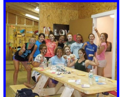
Senior Girls (ages 13 - 15)