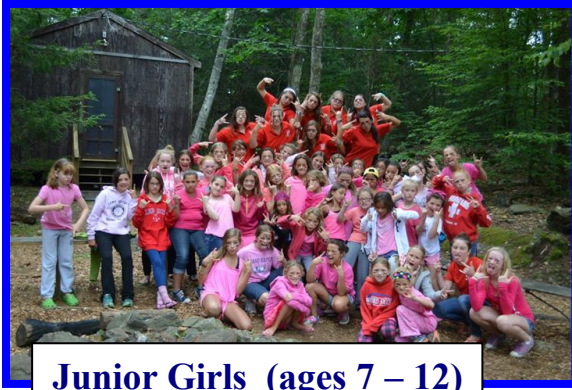
Junior Girls (ages 7 – 12)

The camp is divided into four separate units or living areas. Each unit has five cabins with 9 - 11 campers in each. The units are divided by gender and age: