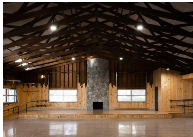
Our brand new dining hall...opened for the summer of 2021!

CAMP ROTARY STAFF MISSION STATEMENT: As a community, the staff of Camp Rotary wishes to provide a safe and fun environment for all who attend. Because the well-being of the campers is our utmost priority, we will constantly focus on each child...to instill the spirit of Rotary in each camper; to encourage each child to test his/her limits and to promote friendship, confidence, diversity and equality. In order to accomplish our goals and to make a positive difference in the lives of all of the campers, we pledge to be positive role models in word and action, to maintain positive and enthusiastic attitudes, and to embrace individuality through tolerance and celebration of diversity. It is through providing this support that we may reach our ultimate goal of each child leaving camp with the positive spirit of Camp Rotary kindling in their hearts for many years to come.